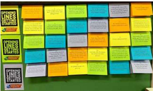
Opening Lines: a bulletin board display from MYP English Language and Literature

MYP students and teachers have worked hard to make the necessary adjustments. Students have been enthusiastic about being at school in person for the first time in many months. They have been conscientious about adapting to the routines requiring social distancing and heightened hygiene. Students have adapted quickly to the new schedule and have dealt effectively with the changes imposed by safety measures.