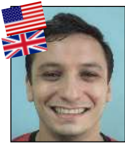
Julian Buck Elementary PE (G2–G6)