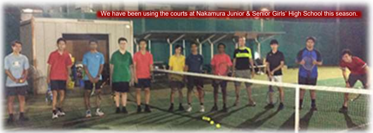
We have been using the courts at Nakamura Junior & Senior Girls' High School this season.