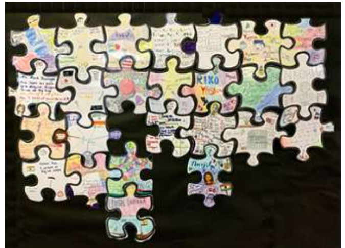
G6A's Puzzle Pieces introducing themselves to MYP

In addition to the academic focus, MYP teachers are helping students to improve their organizational skills and be equipped to handle the stresses that accompany their challenging subject material through