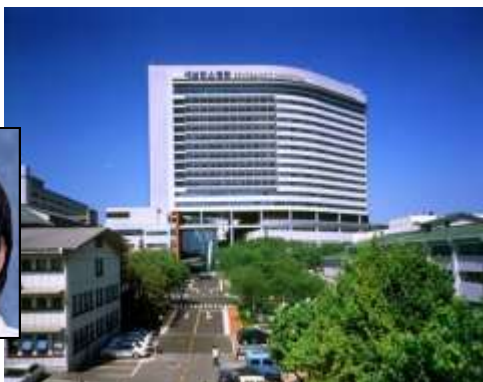
Severance Hospital, Seoul