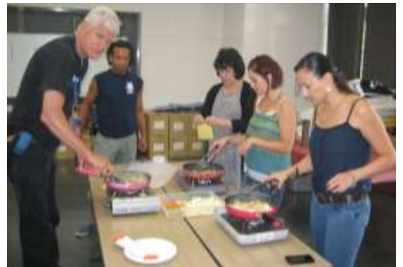
New teachers learning the art of Japanese cuisine under the direction of Japanese language staff.

E-mail addresses for all faculty, both new and continuing, are available on the Contact >> Faculty Directory page of the school website.