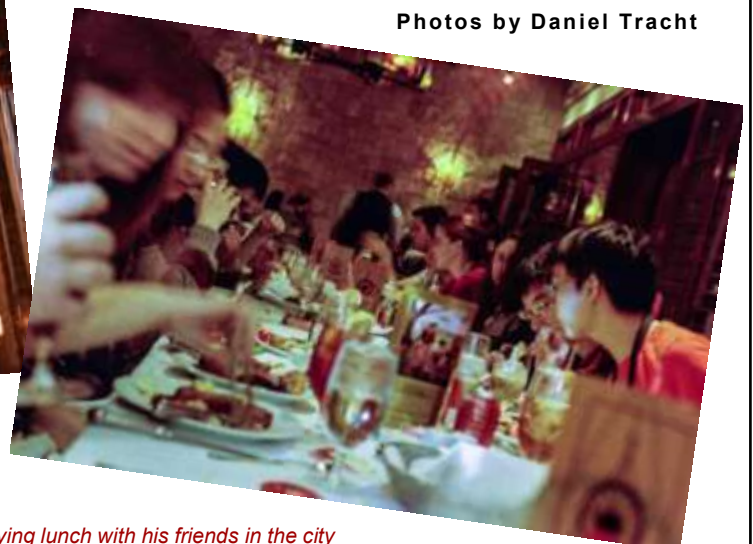
PPO enjoying lunch with his friends in the city