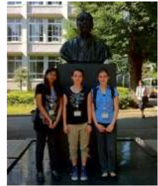
In front of the statue of Yukichi Fukuzawa, founder of Keio University

With no diploma experience of physics or design technology subjects, I had to patiently while my hours researching and investigating the fundamental