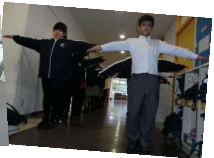
The digital animation club in action.