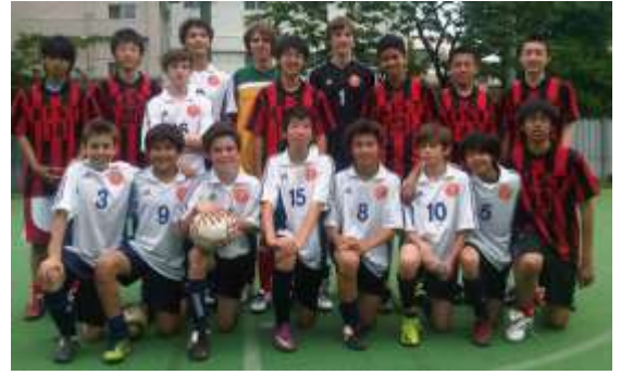
U14 boys futsal (with the BST team)