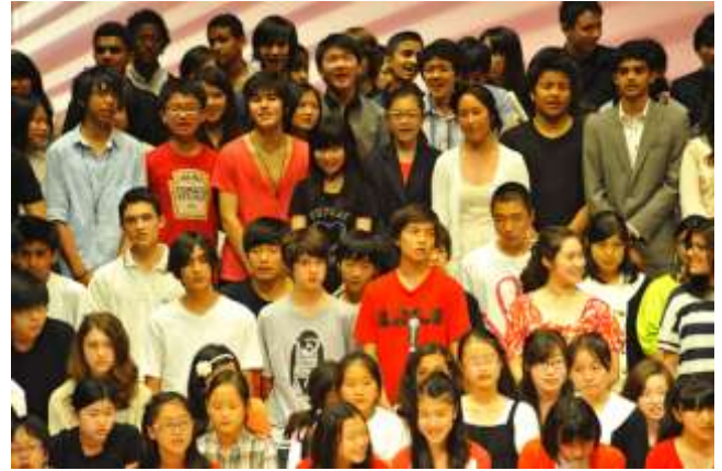
Students on stage at the Secondary Concert.

For Grades 10 through 12, the school is moving ahead with our 1-to-1 laptop initiative. Over the past two years, the school has invested heavily in our IT infrastructure allowing the campus to go completely wireless while providing network access at speeds necessary to successfully integrate technology within our classrooms. Having students begin to use laptops in this manner in G10 will ensure the necessary digital literacy skills are developed which will greatly help our students as they embark on their DP studies and post KIST in college and university settings. Our aim is to provide a 21 st century learning environment while nurturing student responsibilities associated with caring for a personal laptop