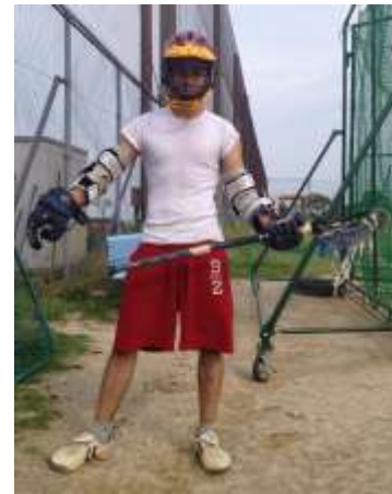
Ready to take on the world.

Soon after that I started my university life. I can't begin to explain how exciting and amazing it was. There were so many events