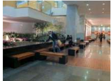
Yonsei University Library

As a College Guidance Counselor, I have been attending college fairs and college explanation events outside of KIST to become acquainted with admissions officers and to obtain up-to-date information about