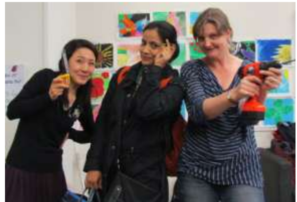
Brunton's Angels with their weapons of mass construction.