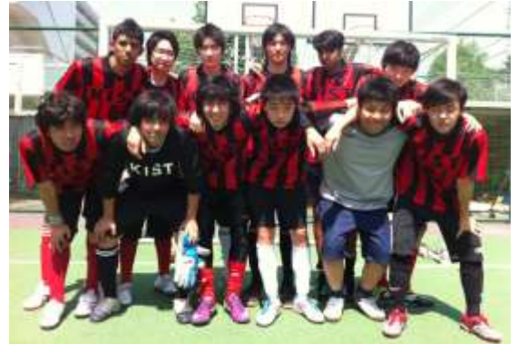
U18 boys futsal