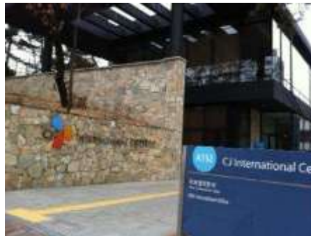
Seoul National University, International Center

admissions and programs. I also take advantage of visiting university campuses by invitation or during my private trips around the area. Since October 2010, I have visited the University of Hong Kong and Savannah College of Art and Design in Hong Kong, National University of Singapore and S.P. Jain University in Singapore, Ritsumeikan Asia Pacific University in Beppu, Ritsumeikan University and Doshisha University in Kyoto. During my recent trip to Seoul, Korea to attend my alma mater (MBA '84) the George Washington University's large alumni event, I also had the chance to visit Seoul National University and Yonsei University. Campus visits provide me with opportunities to see and feel how it would be if our students choose these destinations after graduation as well as to exchange information with