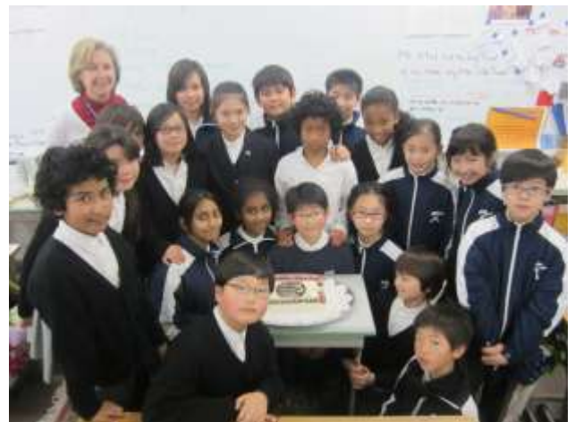
Congratulations Grade 5B!