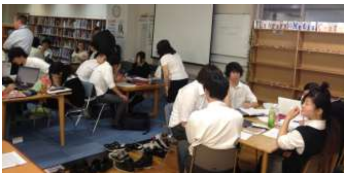
Grade 11 students in action in their TOK/EE class.

Last block on a Friday afternoon continues to be a hive of activity for Grade 11 students as they continue their TOK course. Since the last newsletter entry, students have been working on a TOK Essay in which they are given the opportunity to show their understanding and awareness of the Ways of Knowing. They have had whole class workshops and presentations in the MPR and individual class time with their regular TOK teachers. More recently they have been exploring their first Area of Knowledge, Science.