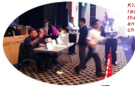
KIST students racing to get their team's answers checked!