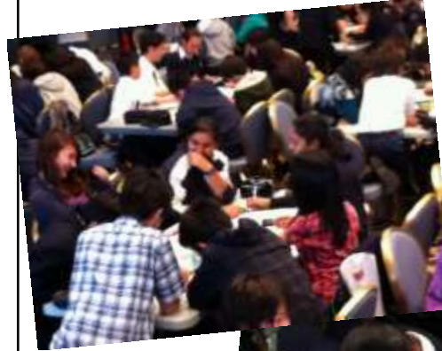
Working with students from other schools was a highlight.