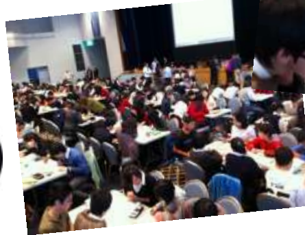
Many international schools attended.