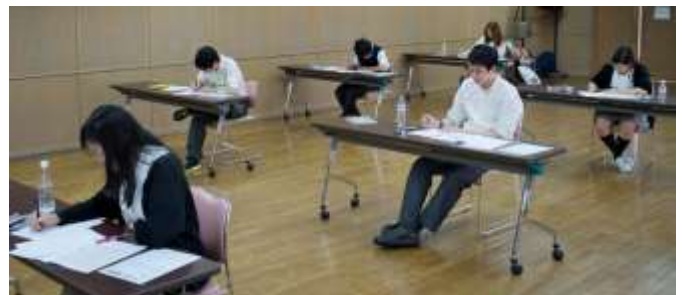
Grade 12 students sitting for their final IB examinations.

In May, Grade 12 completed their final IB Diploma examinations. Whilst the whole school was enjoying their Golden Week holiday, the Grade 12s were doing these examinations in the MPR whilst the rest of the time they were off site at the Morishita Cultural Centre to have the necessary facilities to conduct the assessments.