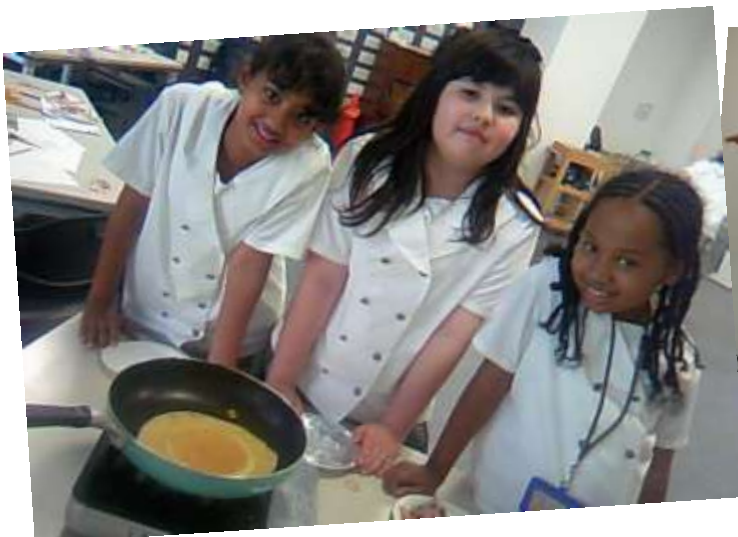
The French club making crepes.