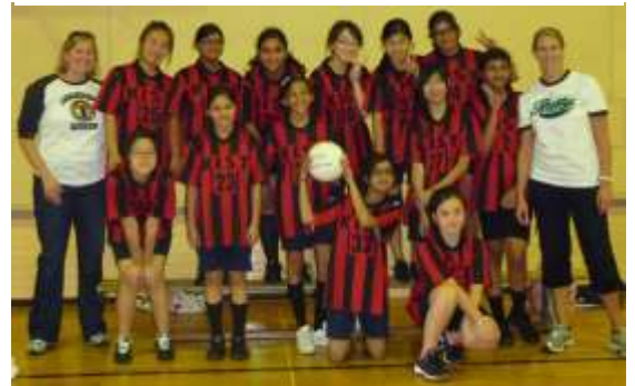
U14 girls volleyball