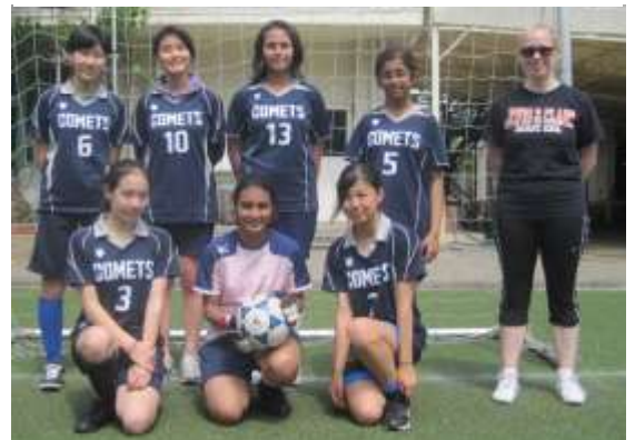
U18 girls futsal