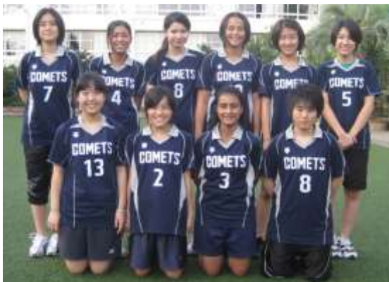
U18 girls volleyball