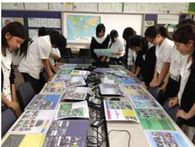
The club getting their first look at the printed pages.