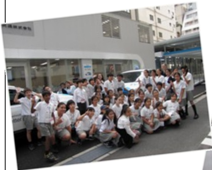
Grade 5 students enjoying their excursion to METI.