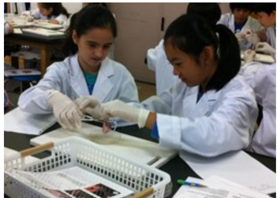
Grade 7 students learning the fine art of dissection.